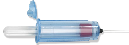
VanishPoint® Blood Collection Tube Holder